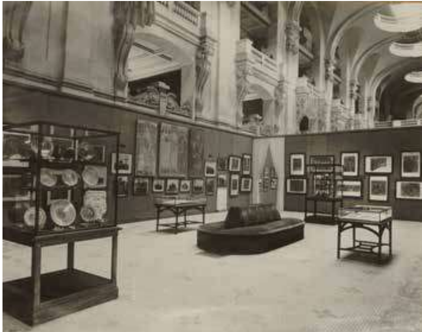
Fig. 2. Exhibition of Byzantine Art, Musée des Arts décoratifs in Paris, Pavillon de Marsan, 1931. MAD Album 309 bis 5, p. 4

Georgian collaborators. 13 The number of the photographs cannot be established, but some can be recognized on the wall facing the large copies of mosaics from the Great Mosque of Damascus (fig. 1). 14 Views of monasteries, landscapes, and architectural