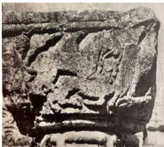
Fig. 6a Capital for the Bagrati Cathedral published in Études sur l'art médiéval en Géorgie et en Arménie , pl. 57.