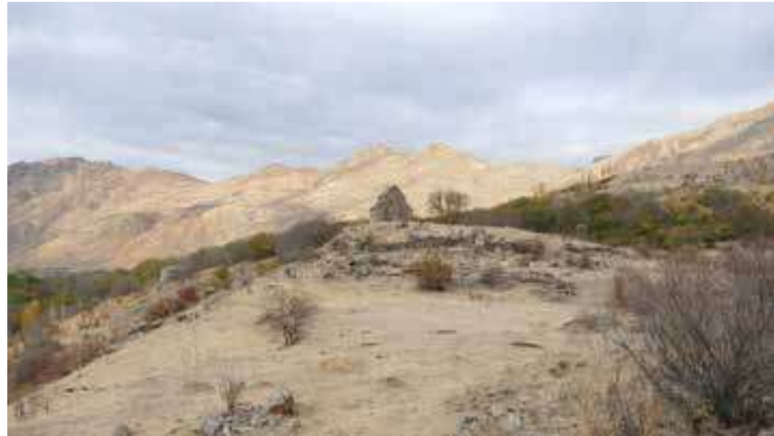
Fig. 5. Zorats Cathedral, Eghegis, Armenia.

the cross and the basilica. Without considering their function and context, and ignoring later transformations or any comparisons with Islamic architecture, Millet's concern is formal classification, according geographical and, implicitly, cultural criteria. The taste for such « simple formes » is he argues because of the inability to reach the wise equilibrium of the Hellenistic and Byzantine buildings.” 31 This sober elegance is regarded as an Armenian feature, imitated by the earliest churches of its neighbor Georgia. Nevertheless, unlike Strzygowski, Millet does not assimilate the Orient exclusively with Armenia 32 . The Orient, as opposed to the Hellenistic and Byzantine traditions, is that of the Ancient Near East – a particularly Persian element vanishing in the realm of Constantinople yet vivid in the Armenian school, which does not admit any protruding forms such as the apse or narthex. 33