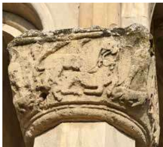
Fig. 6b Georgia, Bagrati Cathedral, the same capital, photograph by the author, 2016

dition. Few photographs and many drawings accompany this attempt to define the appearance of the “couverture nervée” as the source of visual language for the West, making Armenia the cradle of Western civilization. Opposing Strzygowski’s obsession with the basilica and the dome, Baltrušaitis defends, in Focillon’s way, the independence of forms and figures. Since his first publication, the Études sur l’Arménie et la Géorgie , Baltrušaitis sublimates the motif through word and image (Fig. 6a-b). His formalism is different from that elaborated by Millet and later André Grabar who proposed his own model of interpretation, based, like Millet, in formal, historic and religious criteria 42 . Baltrušaitis, instead, departs from the form to reach the intellect beyond time 43 .