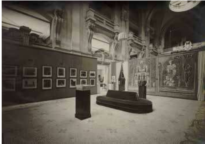
Fig. 1. Exhibition of Byzantine Art, Musée des Arts décoratifs in Paris, Pavillon de Marsan, 1931. MAD Album 309 bis 5, p. 5